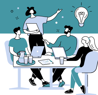
TABLE 2 — Talent Attraction: Winning Top Talent Before Your Competitors Do

This table captured a strong sense of frustration: founders know top talent is out there, but they're losing them too often.