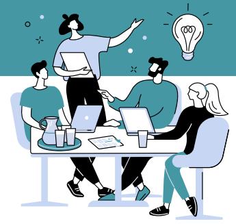
TABLE 3 — Retention & Culture: Keeping A-Players in 2026

The strongest insight from this table was clear: retention starts before day one.